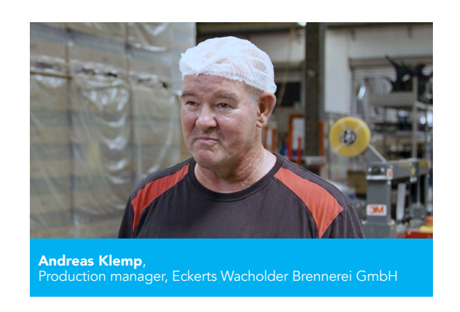
II It's about making work easier for people and saving on personnel costs.

Eckerts Wacholder Brennerei GmbH, a renowned distillery manufacturer, combines generations of tradition with cuttingedge innovation in spirits production. Known for its expertise in spirits bottling, the company has sought to improve its packaging operations through automation. The integration of the Robotiq Palletizing solution enabled Eckerts Wacholder Brennerei GmbH to increase efficiency while maintaining its commitment to quality and craftsmanship.